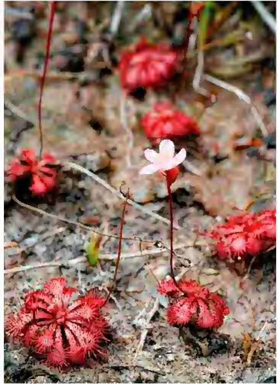
Figure 4: Group of D. spatulata var. bakoensis in Bako National Park, Sarawak, Borneo.